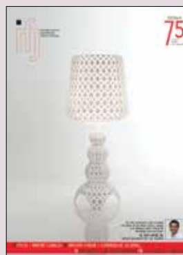
cover courtesy: kartell, italy

inside backcover CANADIAN WOOD backcover HETTICH